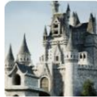
Once Upon a time