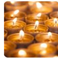
Sparkle and shine